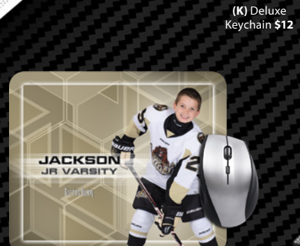
(H) Mousepad $14