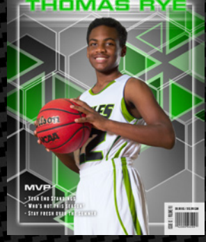
(M) 8x10 Magazine Cover $15 (N) 4x5 Magazine Cover Magnet (2) $12