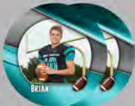
(2) 3" Round Buttons Package J $12.00