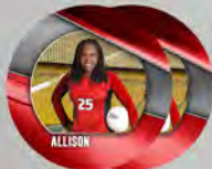
(2) 3" Round Magnets Package M $12.00