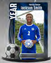
5x7 Acrylic Desk Print Package H $25.00