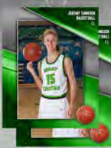
(2) 4x5 Magnets Package K $12.00