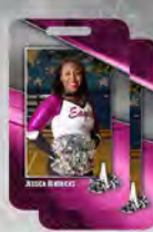
(2) Bag Tags Package Q $12.00