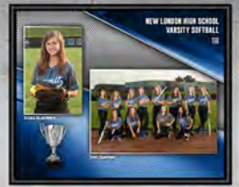
8x10 Sports Mate Plaque Package S $30.00