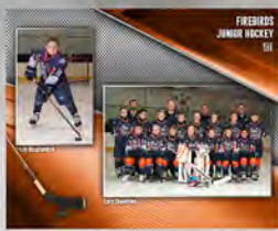
8x10 Sports Mate Package N $20.00