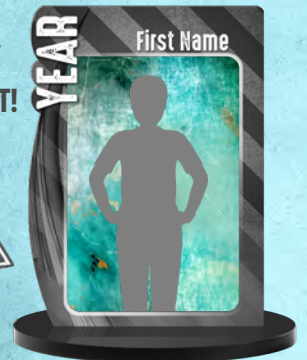
Acrylic Desk Print (with stand)