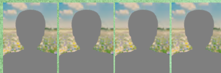
(4) Wallet Magnets