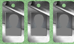
(3) Key Fobs