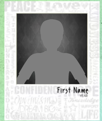
8x10 Word Cloud