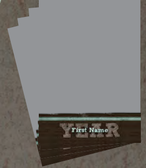
4 Wallet Magnets