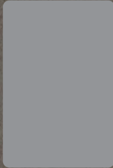
4x6 Aluminum Desk Print (front & back)