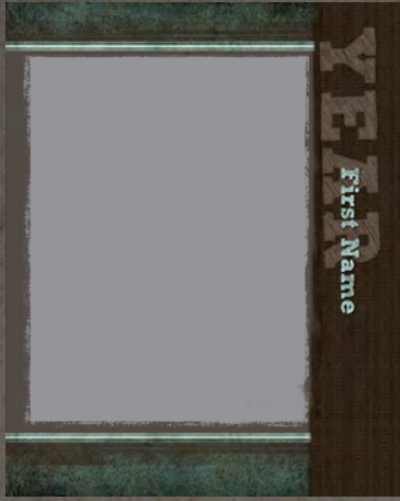
8x10 Sage Tweed Border