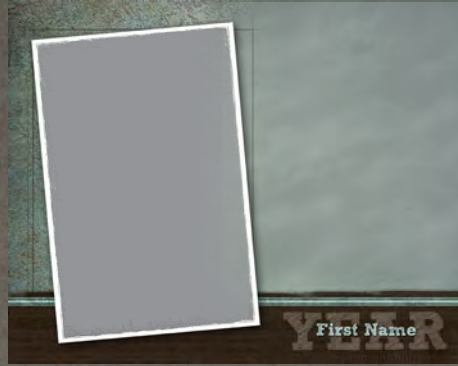
8x10 Sage Tweed Reflections