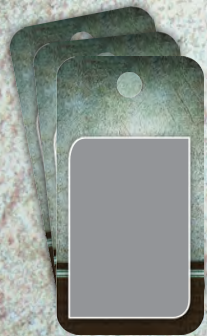
3 Key Fobs