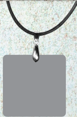
Mother of Pearl Necklace