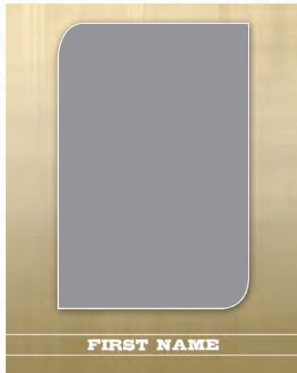
5x7 & 8x10 Border Prints