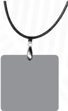
Mother of Pearl Necklace