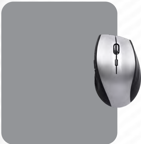
Neoprene Mouse Pad