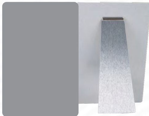
4x6 Aluminum Desk Print