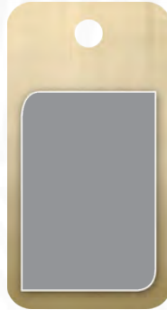
Key Fobs (set of 3)