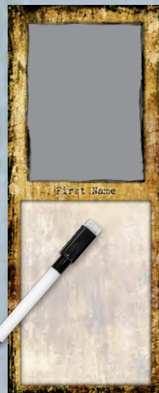
4x10 Locker Magnet