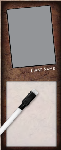
4x10 Locker Magnet