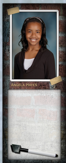
Dry Erase Locker Magnet