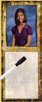
4x10 Locker Magnet