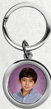
DELUXE KEY CHAIN