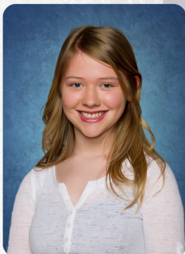
ALUMINUM DESK PRINT