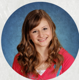
BUTTON OR MAGNET