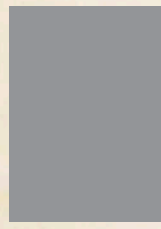
Wallet Magnets (4)