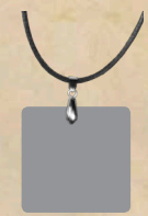
Mother of Pearl Necklace