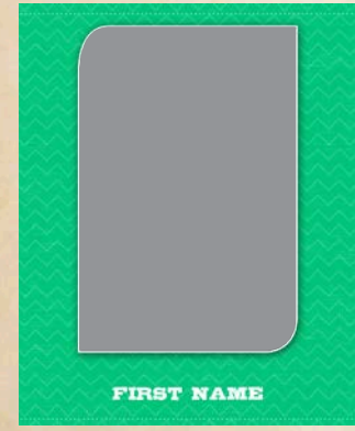
5x7 & 8x10 Border Prints