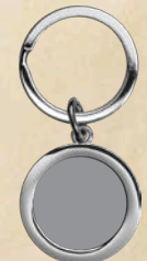
Deluxe Key Chain