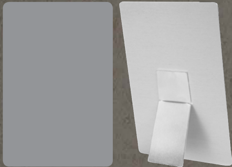
4x6 Aluminum Desk Print (front & back)