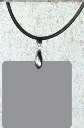
Mother of Pearl Necklace