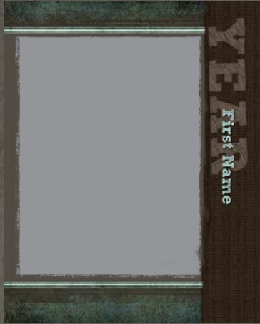
8x10 Sage Tweed Border