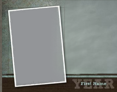
8x10 Sage Tweed Reflections