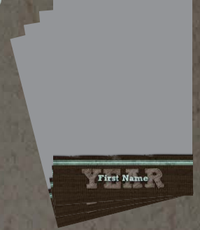
4 Wallet Magnets