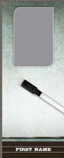
4x10 Locker Magnet