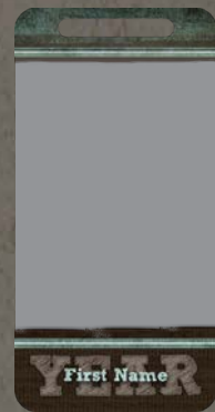
1 3/4 x 3 1/2 Luggage Tag