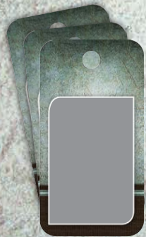
3 Key Fobs