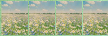
(4) Wallet Magnets