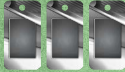
(3) Key Fobs