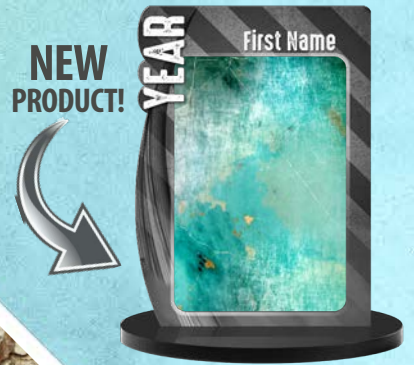
Acrylic Desk Print (with stand)