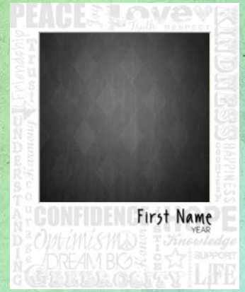
8x10 Word Cloud