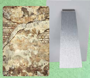
4x6 Metal Desk Print