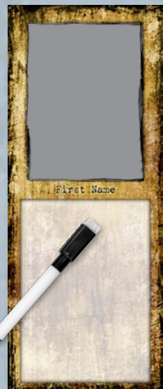
4x10 Locker Magnet