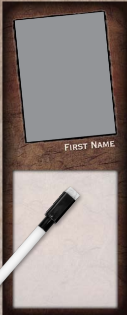
4x10 Locker Magnet