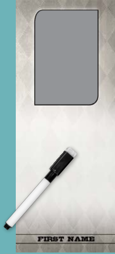
4x10 Locker Magnet