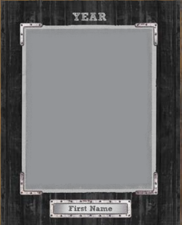
8x10 Rustic Border