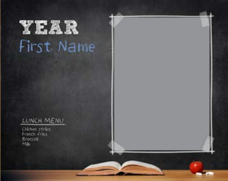
8x10 Chalkboard Personality Portrait