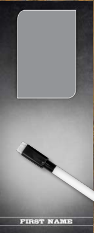
4x10 Locker Magnet