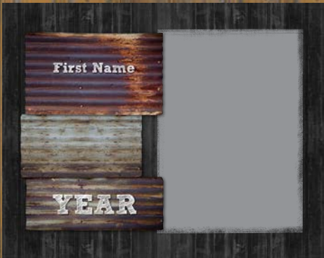
8x10 Rustic Personality Portrait