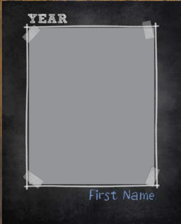
8x10 Chalkboard Border