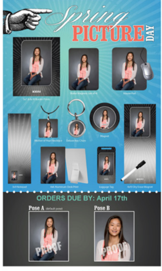
Proof Plan Student Images

2. Are you photographing Green Screen or JPEG? How you photograph a job affects how we setup and design your flyer. You <u>must be approved</u> for green screen before submitting a flyer design request or we cannot proceed with your order. Green screen testing and library setup can take a few weeks, so don't wait!