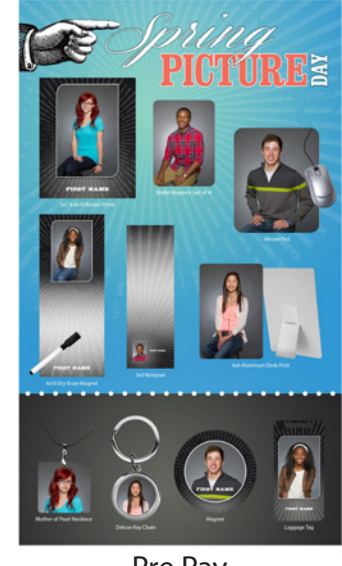
Pre Pay Stock Images