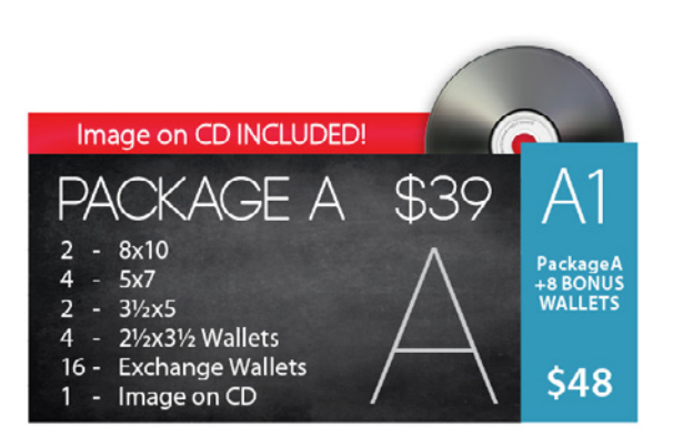
Opt In Example

5. Do you want to offer a package bonus product? You will want to review your options for opting in and opting out. H&H flyers show you how to "opt in" with a bonus wallet package. Also keep in mind offering this as an "opt out" format.