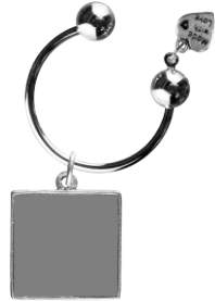
HORSESHOE KEY RING

Keep those you love close to your heart with this heart-shaped pendant attached to a round key ring. $00.00