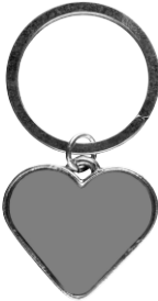
HEART KEY RING

Keep those you love close to your heart with this heart-shaped pendant attached to a round key ring. $00.00