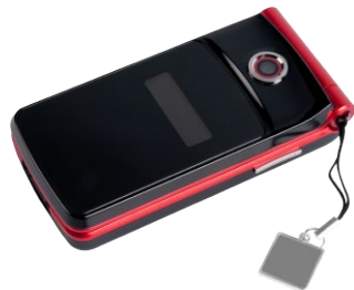
CELL PHONE CHARM

Framed round or square pewter ornaments display a \frac{1}{8} " image. $00.00