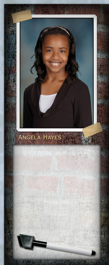
Dry Erase Locker Magnet