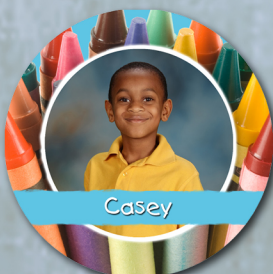
Button or Magnet