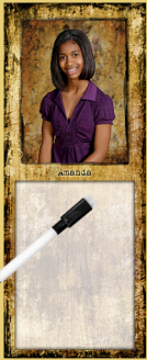
4x10 Locker Magnet